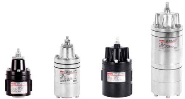
YT-400S YT-405D YT-430S YT-435D